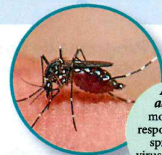
Aedes aegypti mosquito - responsible for spreading viruses & other diseases

You can help by eliminating standing water from any containers, and by protecting yourself and your family from mosquito bites. See below for more information.